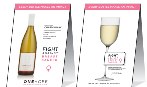
Double Sided Table Tent