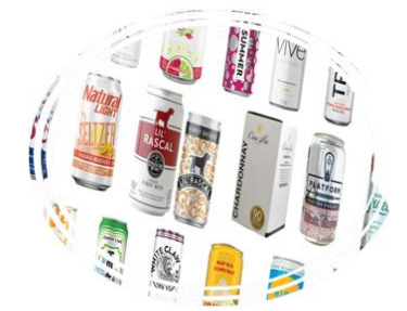
ALTERNATIVE DRINKS ARE HERE TO STAY

Millenials are of age & making an impact