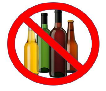
ABSTINENCE IS A VERY REAL (AND GROWING) TREND!