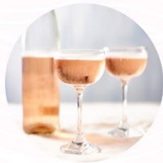
COLUMBIA VALLEY WASHINGTON ROSÉ