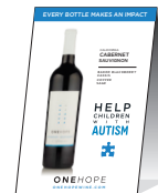
Double Sided Table Tent