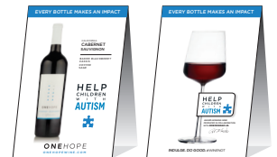
Double Sided Table Tent