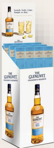
Single Case Bin