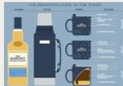
Toddy Recipe Card