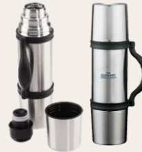
Single and Group Serve Thermoses