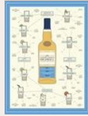
Highball Recipe Card