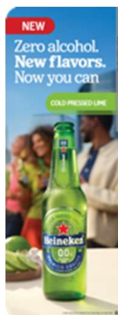
Shelf Violator (1 sku per side)