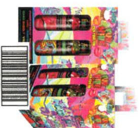
4 PACK - 330ML BOTTLE UPC

FUN WINE IS A FLAVOR-FIRST, GOOD-TO-GO, PREMIUM WINE COCKTAIL. MIAMI BORN, IN THE PURSUIT OF FUN.