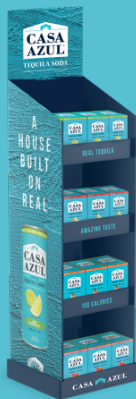
Slim Case Display