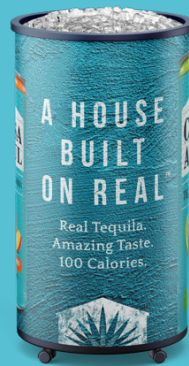
Iceman Barrel Cooler