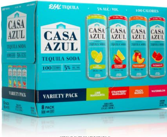
8 Can Variety Pack