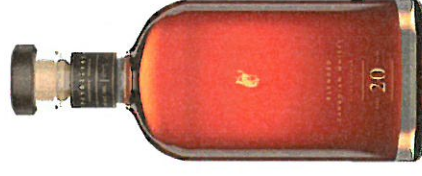
DIRECTOR'S RESERVE (80 Proof) Launched 2016 Packed 4in