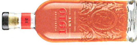
1910 (80 Proof) Launched 2011 Packed 6in