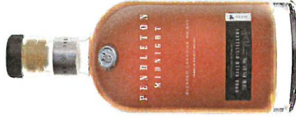
MIDNIGHT (90 Proof) Launched 2015 Packed 12in