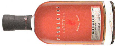
ORIGINAL (80 Proof) Launched 2003 Packed 12in